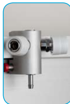
DOUBLE OUTLET For oxygen, air and vacuum, mounted on a sliding clamp. Oxygen outlet Part no. 30080 Air outlet Part no. 30080C Vacuum outlet Part no. 30080B