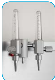
DOUBLE FLOWMETER 1-14L/min for oxygen, mounted on a sliding clamp. Part no. 32016-00