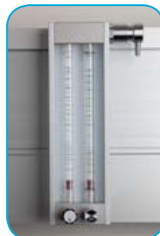
ROTAMETERBOX With two rotameter: oxygen and air. Oxygen 0-10L/min Air 0-10L/min Part no. 11032-00