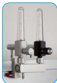
COMBINED FLOWMETER For oxygen and air, mounted on a sliding clamp. Oxygen 1-14L/min Air 1-16L/min Part no. 32031-00