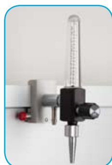
FLOWMETER 1-16L/min for air, mounted on a sliding clamp. Part no. 32015C-00