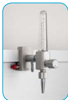
FLOWMETER FOR OXYGEN, Mounted on a sliding clamp. 1-14L/min Part no. 32015-00 1-38L/min Part no. 32038-00 1.2-8.4L/min Part no. 32024-00 0.4-2.5L/min Part no. 32018-00