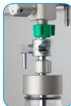
CHANGE-OVER VALVE For oxygen flowmeter. Change between oxygen supply and humidifier Part no. 32015-28